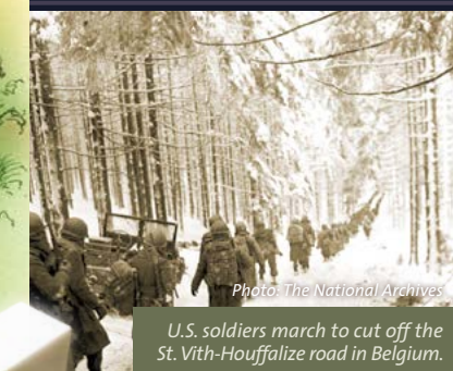
U.S. soldiers march to cut off the St. Vith-Houffalize road in Belgium.

The bronze statue of the Angel of Peace is bestowing the olive branch upon the heroic dead for whom he makes special commendation to the Almighty.