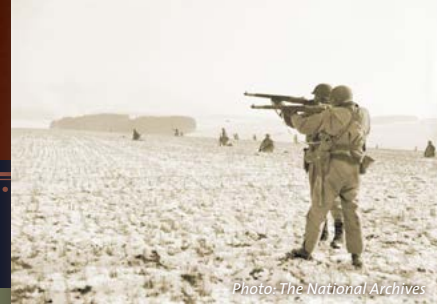
U.S. soldiers fire on German forces encircling Bastogne.